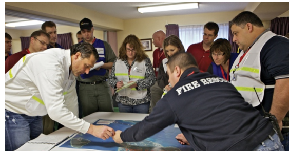
Pipeline operators work with local first responders to practice and be ready for a pipeline incident

Pipeline operators regularly train their employees and practice their response plans to be ready for a pipeline incident. Pipeline operators work with local authorities, first responders, response contractors and other local stakeholders during drills conducted to practice emergency response.