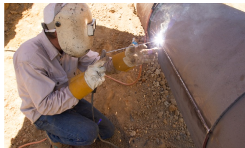
Preventative maintenance allows pipeline operators to keep their pipelines operating safely

The pipeline operator will go out to the pipe segment with the identified issue and perform the appropriate maintenance, such as reapplying protective coating, installing a patch or sleeve around the pipe or replacing that section of pipe.