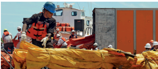
Pipeline operators practice deploying equipment to contain and cleanup pipeline incidents

Pipeline operators have extensive emergency response plans to handle a pipeline incident if one were to occur. The federal government approves operator emergency response plans and operators share their plans with local authorities. Pipeline operators know in advance who to contact in case of an emergency and have support personnel and equipment reserved to deploy to an incident site.